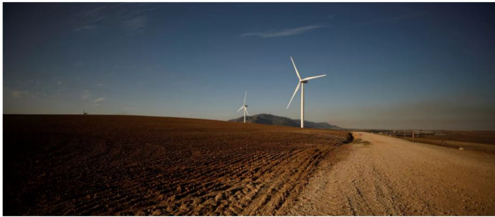
Wind turbines produce renewable energy outside Caledon, South Africa, May 20, 2020.