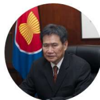
H.E. Dato Lim Jock Hoi